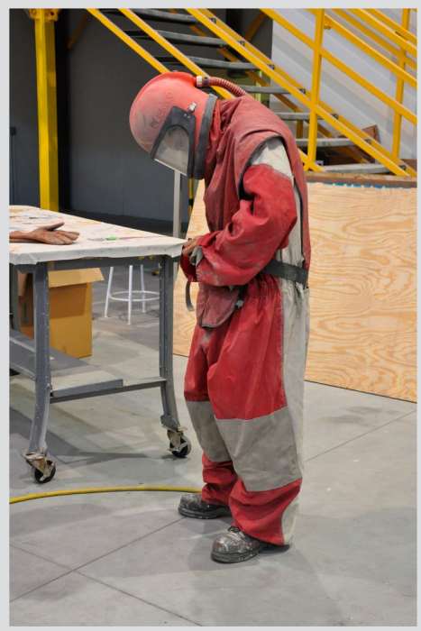
An apprentice suits-up for sandblasting training at the Finishing Trades Institute of the Upper Midwest.

More information about the facility is available at www.fti-um.org