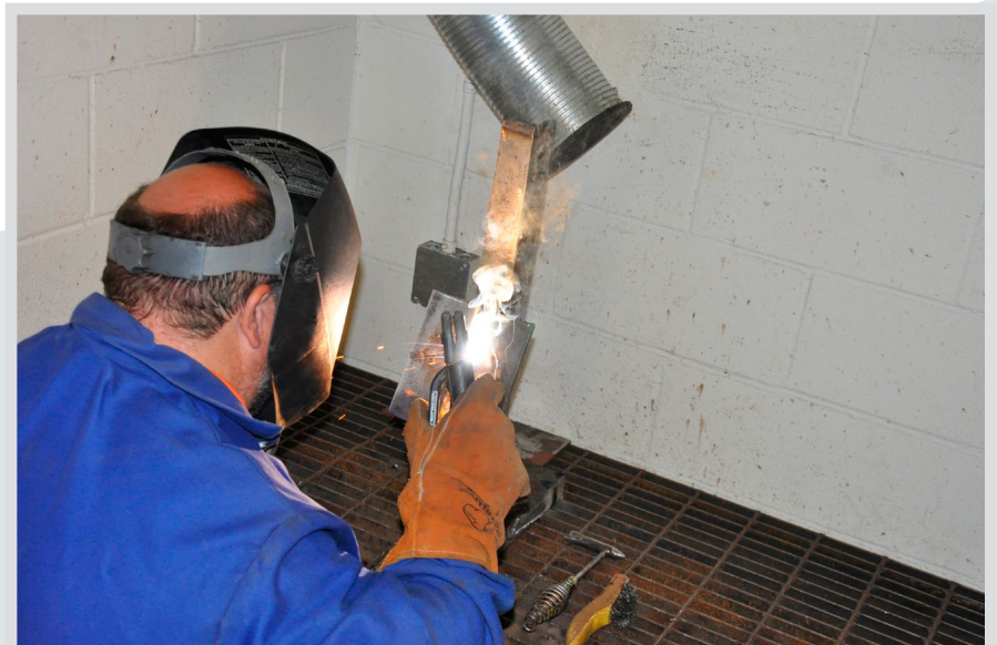
Welding techniques are demonstrated.