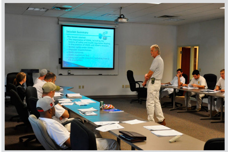
Apprentices and trainers in an OSHA 10 classroom.