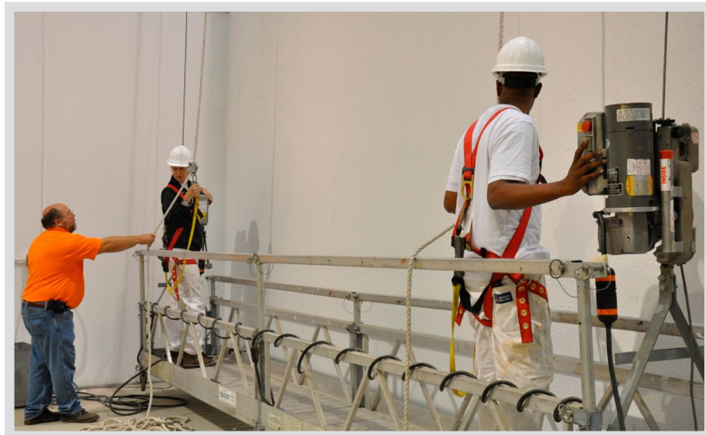
Students work with a swing stage during a training session.