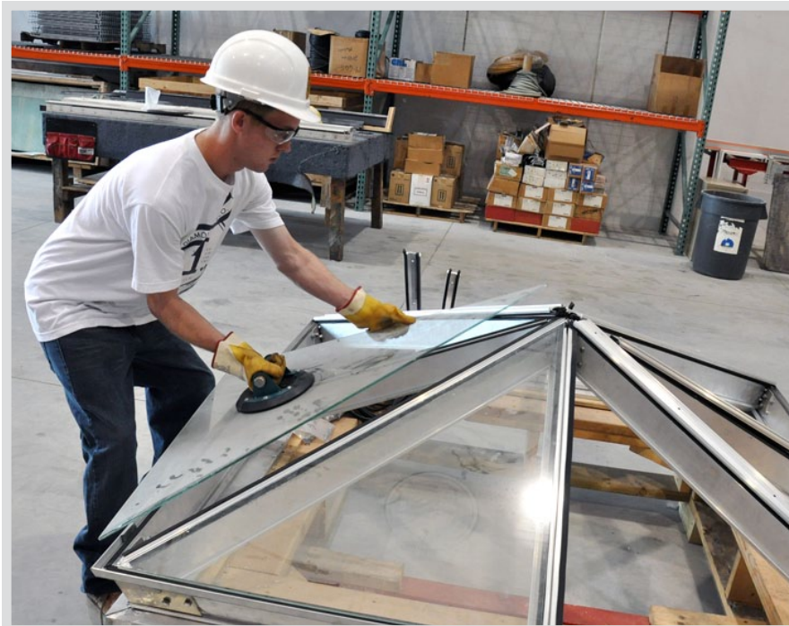
An apprentice at the Finishing Trades Institute of the Upper Midwest in Little Canada, Minn., demonstrates setting glass panels.