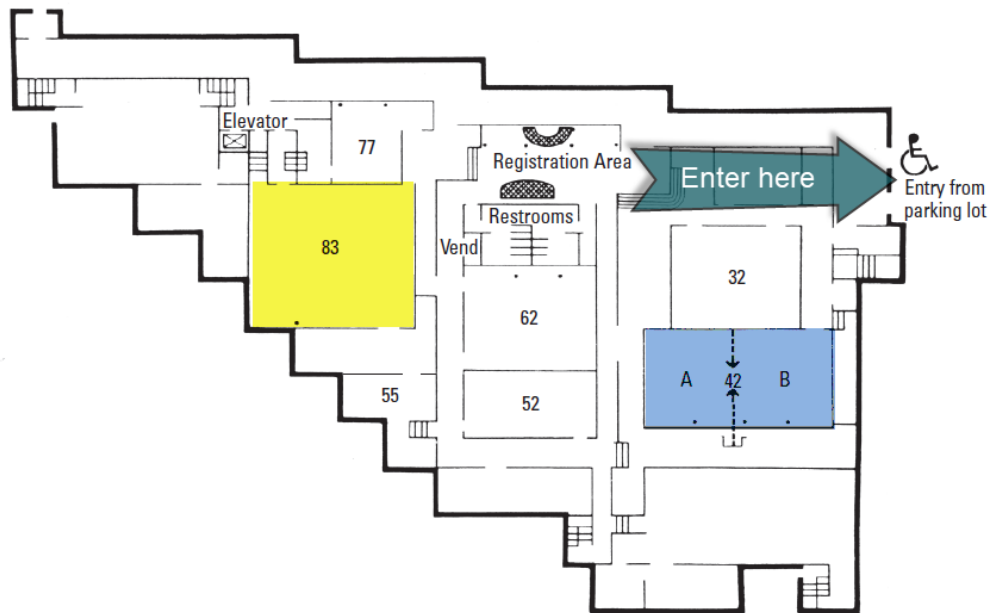
Lower Level Floor Plan

Electrical exams will be given on the lower level in Room 42 highlighted in blue above and on the upper level in Room 135 highlighted in yellow below: