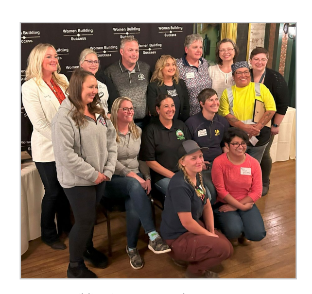
Women Building Success awards ceremony.

Women Building Success works to celebrate and uplift the work that women do every day while working in the construction trades. <u>Learn more about Women Building Success</u>.