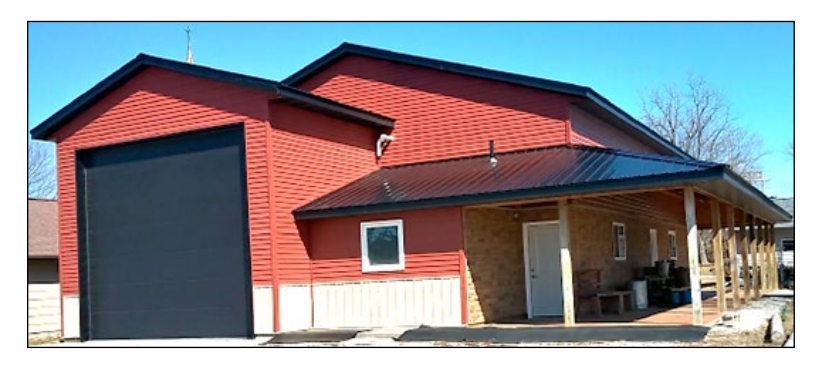
Example of a barndominium/shouse.

These structures often have metal panel roofing and siding that is associated with barns and storage buildings. Unlike conventional "stick-built" homes that require a foundation and footing around the entire perimeter of the home, post frame structures often require a post and footing placed every six to eight feet.