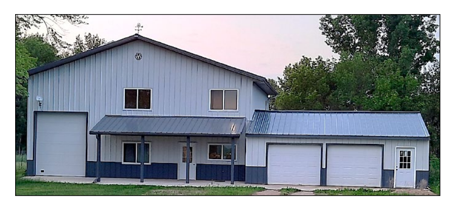
Example of a barndominium/shouse.

Exterior siding or other cladding must comply with the MNRC. Wood siding, wood sheathing and wall framing on the exterior of the structure must have a minimum of 6 inches of clearance to grade or decay protected by use of naturally durable or preservative treated wood. Metal panel siding must comply with the manufacturer's installation instructions and may require 6-inch to 8-inch clearance to grade to protect it from rusting. [R317.1, R317.1.2]