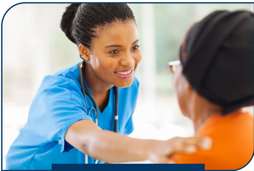
Health Care Services