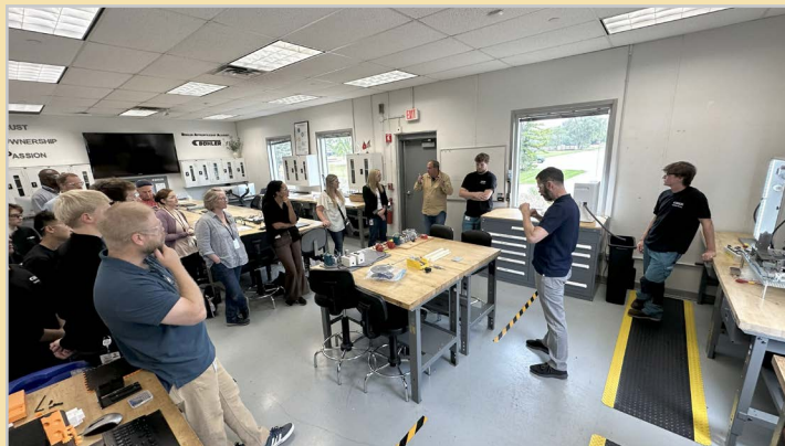
Apprenticeship Minnesota staff members at Buhler Apprenticeship Academy.