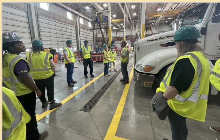
Apprenticeship Minnesota staff members learn about operating engineers.