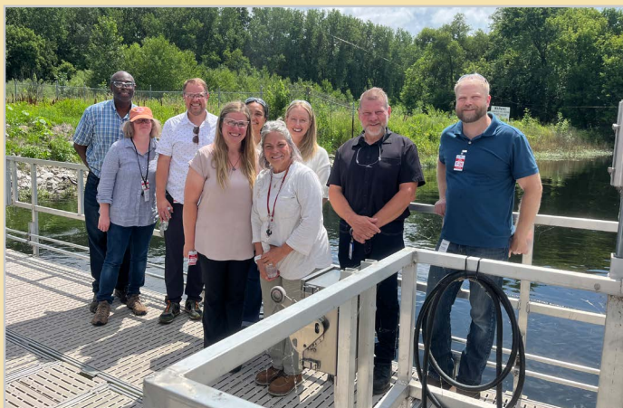
Apprenticeship Minnesota tour of the Met Council.

We appreciate all the programs that take time out of their busy schedules to host tours. These visits help our staff members better understand each program, allowing them to provide more relevant technical assistance and strengthen outreach efforts.